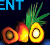
PALM OIL MILL EFFLUENT